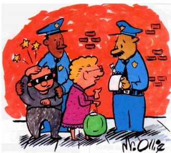
"And I said, 'As a matter of fact, I do have a bowling ball in my bag.'"