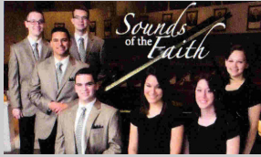
Sounds of the Faith To be announced