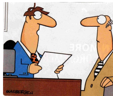
"I'm recommending a tax hike. Hike deep into the woods where the IRS can't find you."

"A closet is a slow, lifetime collection of what you are. Usually a mess."