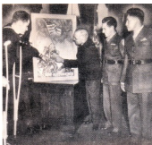
Oval Office, April 20, 1945 Doc Bradley, Harry Truman, Rene Gagnon, and Ira Hayes.

Vietnam was called the first "television war." Tet illustrated how powerful and corrosive this new medium could be for a representative democracy at war. In an age of instantaneous communications, images matter more than body counts or battle damage assessments (BDAs), more than statistics or metrics, more than congressional testimony or Oval Office addresses. When the images don't match the message, public support can erode rapidly.