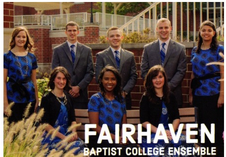
Sunday, February 25th, 2018

I SAW A POSTER TODAY THAT ASKED, "HAVE YOU SEEN MY CAT?" SO I CALLED THE PHONE NUMBER AND SAID THAT I HAVEN'T. I LIKE TO HELP WHERE I CAN.