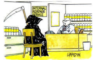
“Of course, we could just drop the audit and agree henceforth to leave each other alone.”

“What made you give it up?” the owner asked. Handing her the bill, he answered, “I couldn’t afford the cut in pay.”