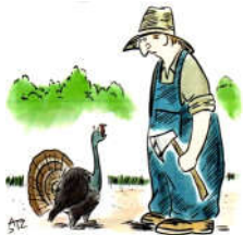
“Yeah, I’m full of gluten.”

Let me ask you a question. Would God call a man to preach His Word and not give it to him?