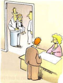
“He’s pretty cool. It’s the little guy that spreads all the gossip.”

A plumber had just finished cleaning out a home’s septic tank. He was still wiping off his hands when the owner said, “You always do such good work for us. Is this the field you always want to go into?”