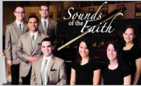
Sounds of the Faith To be announced