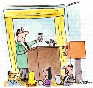
"WE DECIDED TO RECALL OUR NEW DRUG BECAUSE A COMMON SIDE EFFECT IS LAWSUITS."