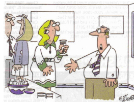
"I'M TERRIBLE WITH NAMES. MINE IS EITHER BRADLEY OR MIKE."

A judge asked a defendant, "Have I seen you before?" "You have, your honor," the defendant replied. "I gave your daughter singing lessons." "Oh, that's right. I sentence you to thirty years hard labor."