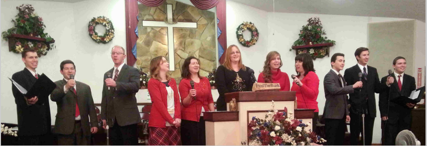
Graduates of Heritage Baptist Academy