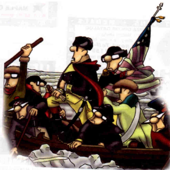
"And put your cell phones on vibrate."