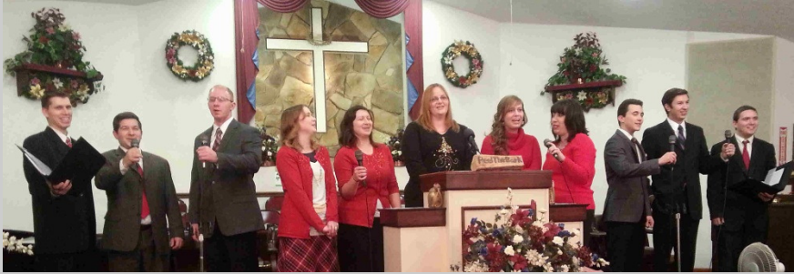
Graduates of Heritage Baptist Academy