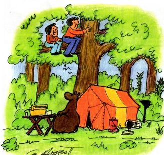
"BOY, THIS IS REALLY QUALITY TIME, ISN'T IT, DAD?"

TODAY'S GANGSTER MOVIES ARE SELF DEFEATING. IT'S HARD TO SAY CRIME DOESN'T PAY WHEN IT COSTS $9.50 TO SEE IT.