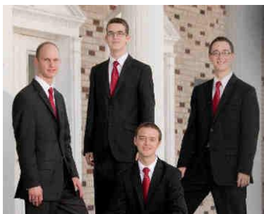
The Berean Quartet will be with us July 24th.