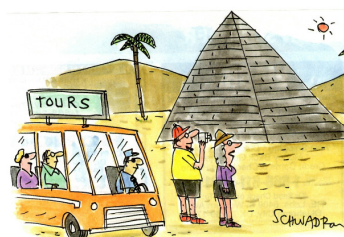
"TALK ABOUT GOVERNMENT WASTE! A TOMBSTONE WOULD HAVE BEEN SUFFICIENT."

"IT WAS PROPOSED THIS WEEK THAT MEMBERS OF CONGRESS USE VIDEO CONFERENCING AND OTHER REMOTE TECHNOLOGY TO WORK FROM THEIR HOME STATES INSTEAD OF WASHINGTON. THEY FIGURE THEY CAN GET JUST AS MUCH 'NOT DONE' AT HOME AS THEY GET 'NOT DONE' IN WASHINGTON."