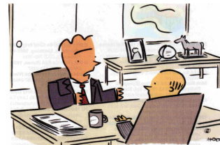
“I’M A VICTIM OF MY OWN SUCCESS. WHO DO I SUE?”