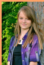
A THREE YEAR WINNER!

"WELL, HE WAS JUST JEALOUS OF ME. EVERYONE THOUGHT I WAS THE FOREMAN."