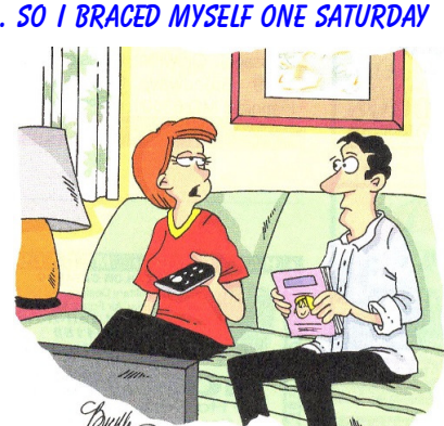
"YOU'RE NOT YOURSELF TODAY. TO WHAT DO I OWE THIS UNIQUE PLEASURE?"