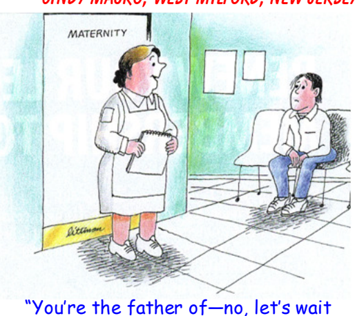
"You're the father of—no, let's wait until the TV station gets here."