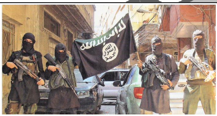
(not the local Rotary Club)

When the U.S. government saw Iran-supported Shiites assuming disproportionate power under Maliki, it did not take action addressing the grievances of the. rest of the population mainly Kurds or Sunnis accustomed to political power under Hussein. Under the Maliki government, the oil revenues of the Iraqi state went to the Shia population and a small percentage went to the Kurds in the north,