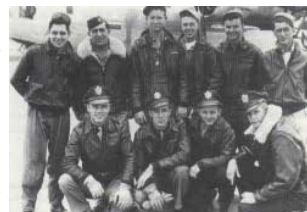
The crew of Connie