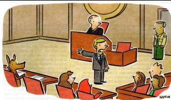
"YES, HE ATTEMPTED TO EAT HER. THAT'S NOT IN DISPUTE. BUT I INTEND TO PROVE THAT MS. RIDING HOOD—BY MOCKING MY CLIENT'S EYES, EARS, AND TEETH—PROVOKED HIM!"