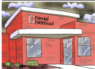
A walkout of children you won't be seeing.

I Peter 1:23 says, "...the word of God, which liveth and abideth for ever." Mark 13:31 says, "Heaven and earth shall pass away: but my words shall not pass away." I Peter 1:25 says, "But the word of the LORD endureth for ever...." Isaiah 40:8 says, "The grass withereth, the flower fadeth: but the word of our God shall stand for ever." Matthew 5:18, "...One jot or one tittle shall in no wise pass from the law..." Luke 21:33 says, "...my words shall not pass away."