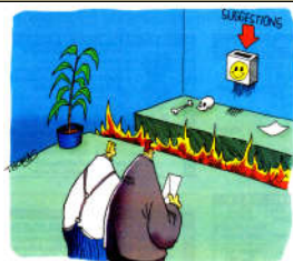
"They really don't encourage feedback here, do they?"