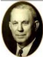
Dr. J. Frank Norris

J. Frank Norris (1877-1952) was called, "The Fighting Fundamentalist," "The Texas Tornado," and "The Two-Gun Parson." One of the most controversial and colorful figures of the history of fundamentalism, he earned these and other titles during a 43-year ministry as pastor of the First Baptist Church of Fort Worth, Texas.