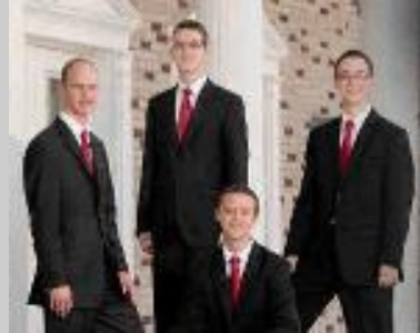
Special Singers—The Berean Quartet

Plus: Go-Karts! Paintball! Food! Horses! Hayrides!