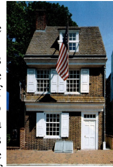
The Betsy Ross House

Most memorable is the story's climax, in which the seamstress—looking at the six-pointed stars in the general's drawing—folds a piece of paper just so and, with one snip of her scissors, reveals (and proposes) a perfect five-pointed star. In the legend of our flag's origins, Washington is convinced and an important element of our national identity is confirmed.