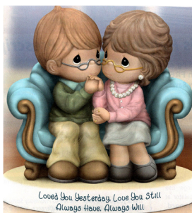
To All Grandparents