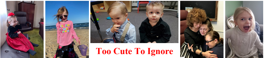
Too Cute To Ignore

The point is that giving is an important principle in having a right relationship with anyone.