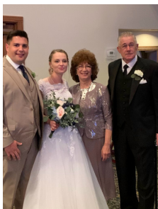
Day Of Wedding