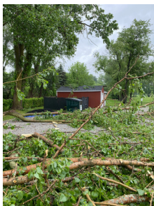
Day Before Wedding