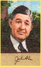
John R. Rice