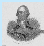
John Peter Muhlenberg

In 1775, John Peter Muhlenberg, who was a pastor like his father Henry, preached a message on Ecclesiastes 3:1 , “For everything there is a season, and a time for every matter under heaven.” He closed his message by saying: