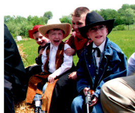
Round Up Sunday

If you can get arrested for hunting or fishing without a license, but not for entering and remaining in the country illegally — you might live in a nation that was founded by geniuses but is run by idiots.