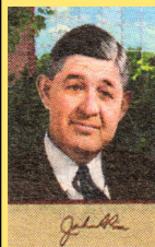
John R. Rice