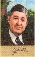
John R. Rice

It is a foolish idea, fostered by those who hate evangelism, that the evangelists are ignorant men who deal only in the emotions, who do very superficial work, and are generally unlearned. The exact opposite is the case. Not only have leading evangelists been men of great learning, but they have done more to establish Christian education than any other single group of ministers.