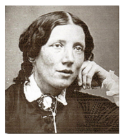
Harriet Beecher Stowe