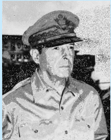
Five Star General Douglas MacArthur