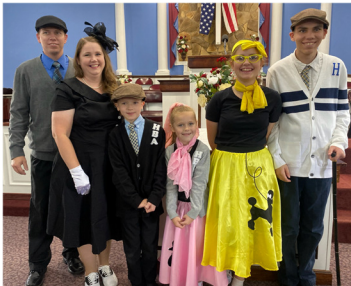
The Baker Family