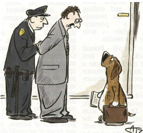
"You were the whistleblower? Some best friend you turned out to be!"

A PHOTOGRAPHER WAS HIRED TO TAKE PICTURES AT A LAWYERS' CONVENTION. AFTER LINING EVERYONE UP FOR A GROUP SHOT, HE SHOUTED, "ON THE COUNT OF THREE, EVERYONE SAY, FEES!"