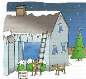
"Last Christmas, some fat guy in a red suit got past me. Not this year!"