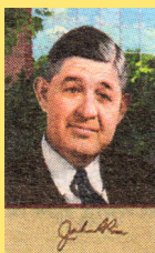
John R. Rice