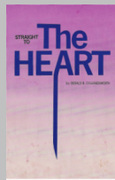
Straight To The Heart