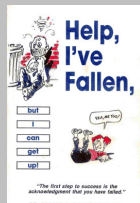
Help, I've Fallen. But I Can Get Up.

Available in the Fundamental Treasures Bookstore