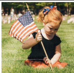
Why We Fight!

We read the account of her conversion in Luke 8 . When Jesus cast out those devils from her, she had no idea what the future held. Other than her conversion, every time she is mentioned in Scripture, she is mentioned in a positive light as a follower of Christ. She had no idea that one day she would be standing at the Cross as the Son of God paid the sin debt for the world.