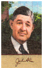
John R. Rice

I love the Christmas season. I find great joy in preaching on the Christmas themes of the angels, the shepherds, the manger, the virgin birth, the wise men. I have great joy in the Christmas carols. There is a joyful, happy note of worship in our home, and thank God, in my heart, through the Christmastime. I love the gathering together of my loved ones and family for Christmas. I love to give gifts, and I rejoice to be remembered by my loved ones and friends. I love the Christmas season.