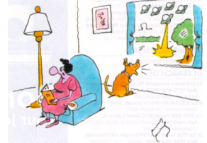
"Must you bark at everything?"

"I wanted our street to have the prettiest decorations in the neighborhood so I strung lit colored balls from house to house, all the way down the block. I did all the electrical wiring myself. If you'd like further information, just drive down Moorpark Street in North Hollywood. We're the third pile of ashes from the corner." - Bob Hope